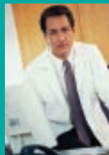
Chart Sign Off