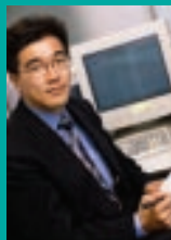
Chart Review and Audit