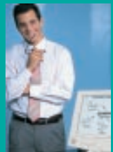
Cost Effective eCharts

Now, thanks to ChartOne, you can have on demand access to medical records—anytime, from anywhere in your facility or remote locations, via the Internet.