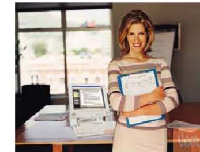
On Demand Release of Information