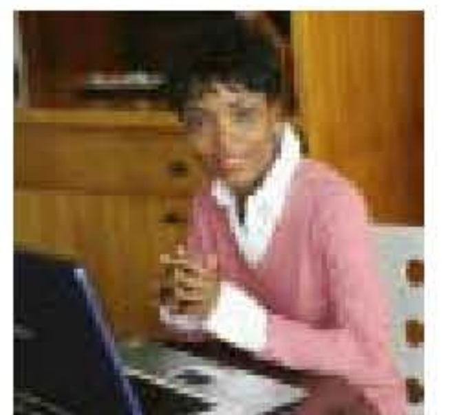
On Demand Remote Coding