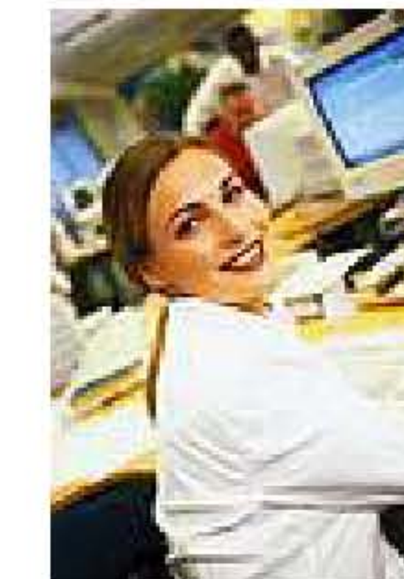
On Demand Chart Completion