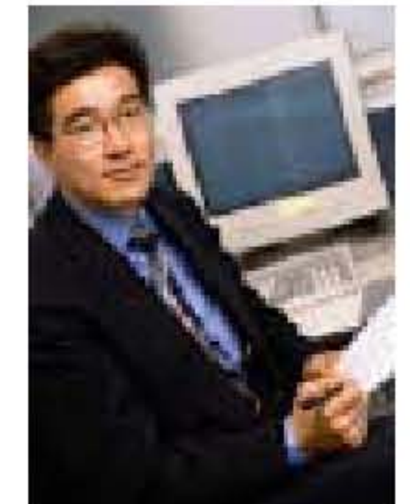
On Demand Review And Audit