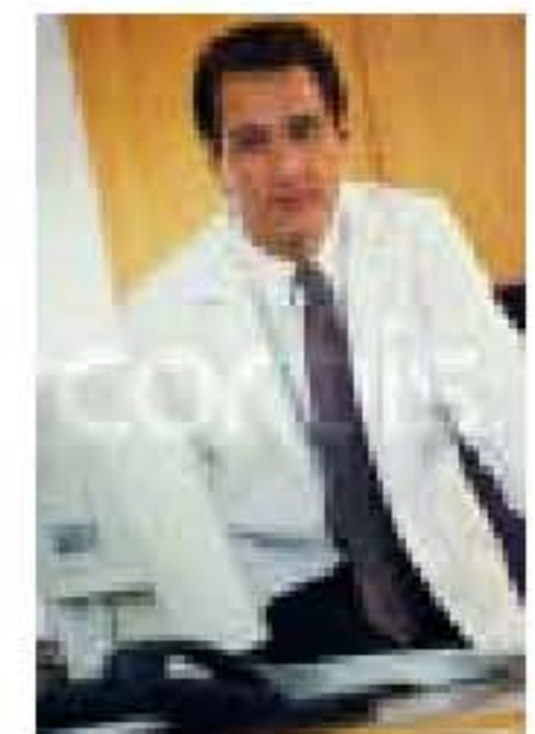
On Demand Chart Signoff