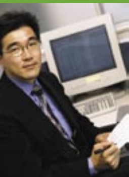
On Demand Review and Audit