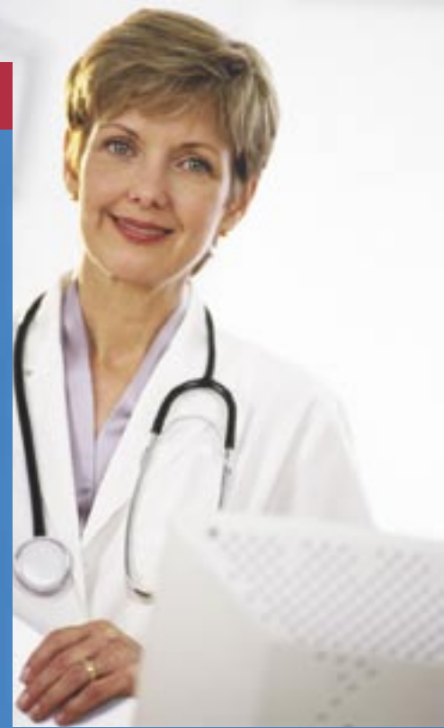
On Demand Chart Sign Off