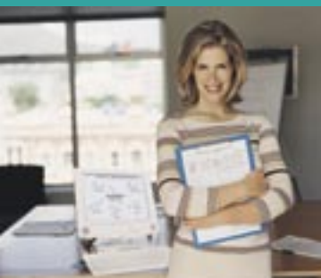
On Demand Release of Information

ChartOne gets you up and running quickly. You'll realize immediate benefits, like reduced accounts receivable days and enhanced patient care.