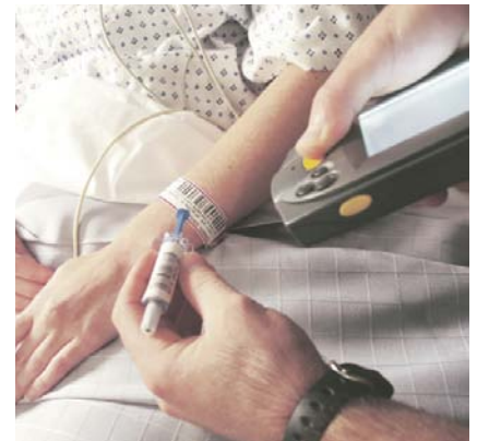
Point-of-care bar-code scanning

McKesson QuickStart Program fast tracks your medication safety initiative