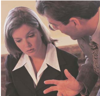
Assessment and support services